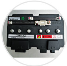
Italy ZAPI AC Controller