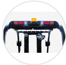
Rotary Warning Light