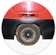
Minimum Turning Radius